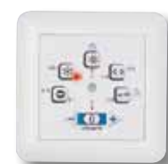
control unit BDE-E